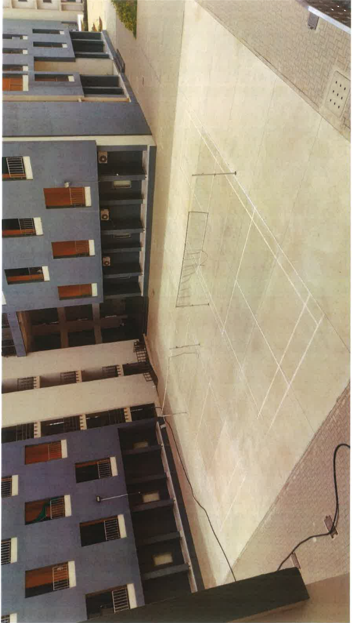
Proposed area for Event.