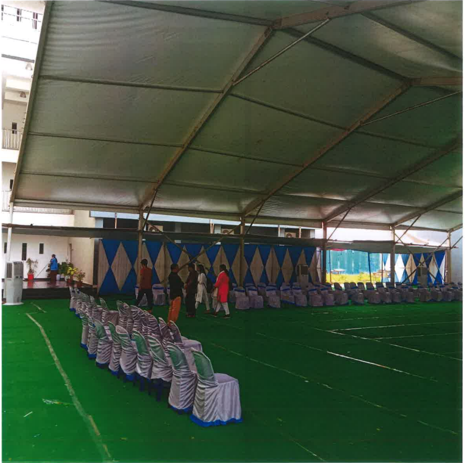
Reference Image of plastic Pandal & Carpet Side Carpet.